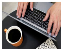
LOW THRESHOLD COUNSELLING & GUIDANCE

Simulation environments “from home to hospital”