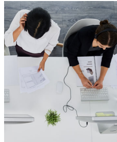
Testbed Helsinki City of Helsinki