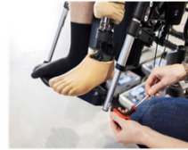
ORTHOTICS AND PROSTHETICS