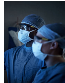
HUS Testbed Helsinki University Hospital